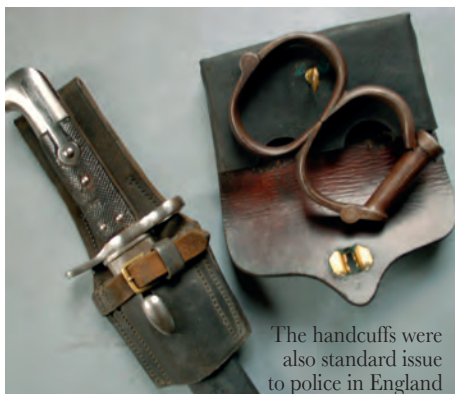
The handcuffs were also standard issue to police in England