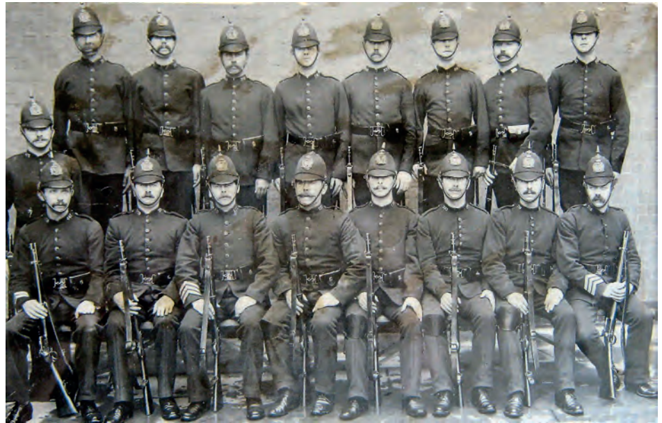
RIC, E District, Belfast 1898. With their Snider carbines. Handcuff pouch and bayonet (just visible) attached to waist belts.

As for the bayonet, an equally simple solution was found. At 18mm, the Martini Henry carbine had a slightly smaller outside muzzle diameter to the Snider. Other than that, the bayonet fitting was identical. All that had to be done was to bush the bayonet muzzle ring from 20mm to 18mm, and the adaptation was complete.