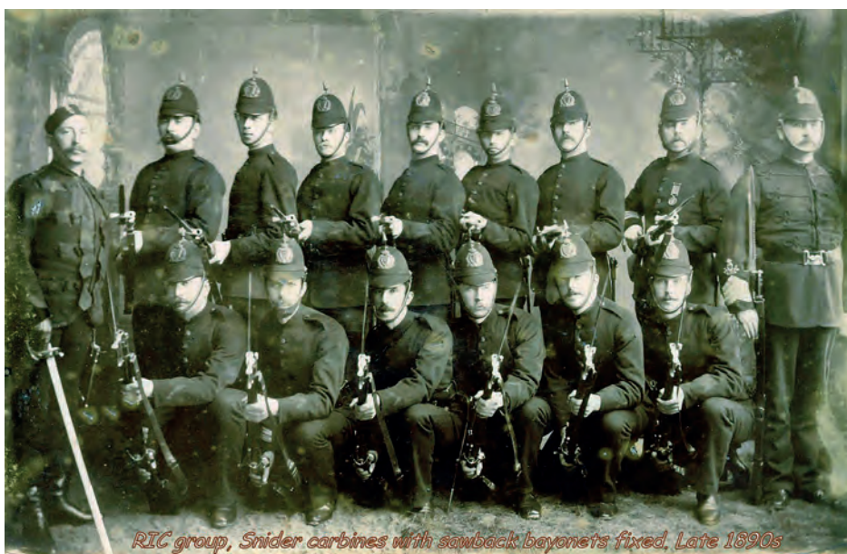
RIC group, Snider carbines with sawback bayonets fixed, Late 1890s