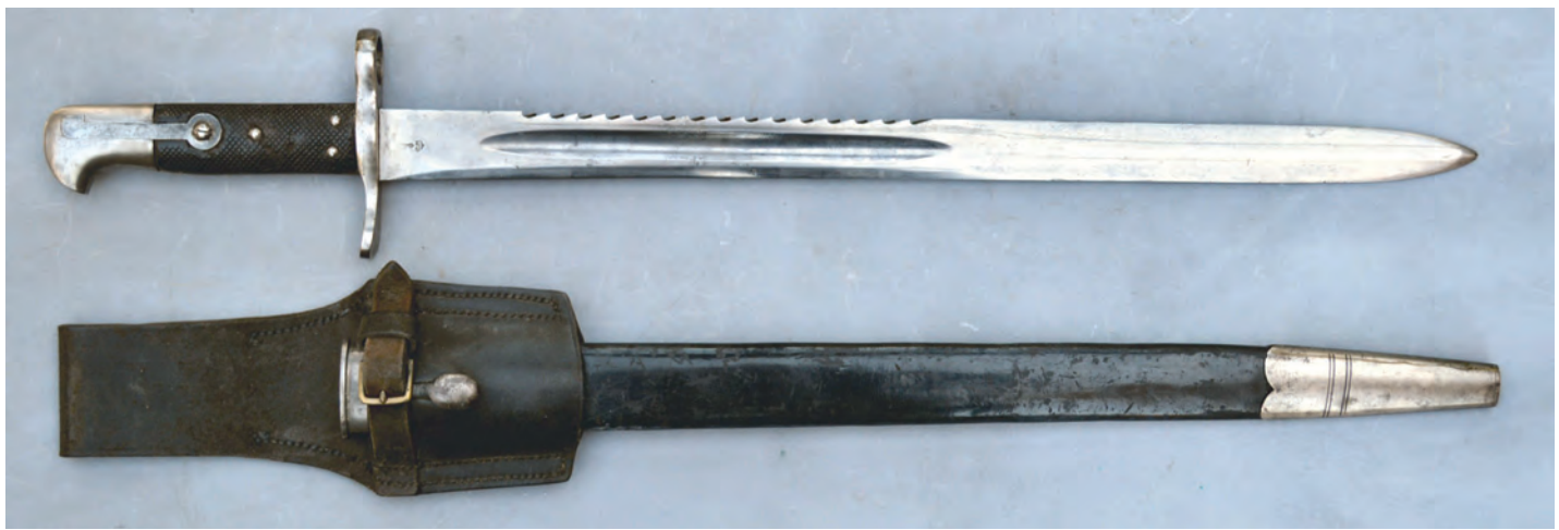
The Irish Constabulary bayonet, with 18 inch sawback blade, black leather frog and scabbard.