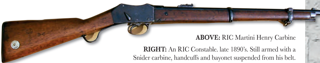
ABOVE: RIC Martini Henry Carbine

Originally issued with the Snider, it was refitted to the Martini, and, old fashioned though it is, many of the force will be sorry to see it go. Its strange saw-toothed back has puzzled every observer, and the men themselves are not altogether clear as to its exact use. The most probable explanation is that it was intended to prevent an opponent wrestling it away when a force was engaged in driving back a crowd with rifles carried at the "port." The R.I.C. have always been strongly armed, each man when fully equipped carrying rifle, revolver, sword, and truncheon, and ominous as the first three sound, it is in the last, strange to say, that was proved the most formidable weapon. Organised and trained as a military force, and repeatedly commended for the soldiery appearance and smartness, the men have not taken too kindly to the rifle, but with batons and blackthorns they can do much more than hold their own.