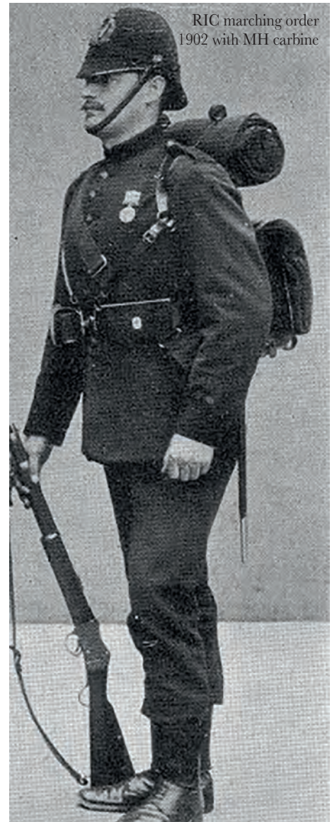
RIC marching order 1902 with MH carbine

Further indication of bushing the sawback bayonets to fit the Martini Henry appear in the report for fiscal year end 1903 at RSAF Enfield: '1,192 sword bayonets, Snider, converted for use with the MH carbine RIC - cost - £156.3.7d'.