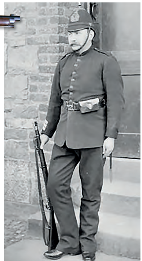
RIGHT: An RIC Constable, late 1890's. Still armed with a Snider carbine, handcuffs and bayonet suspended from his belt.