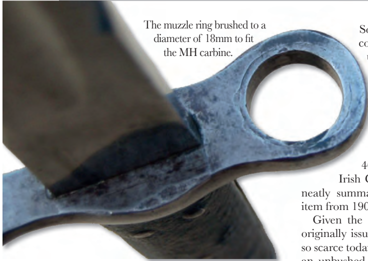
The muzzle ring brushed to a diameter of 18mm to fit the MH carbine.

So it would appear that the only cost incurred by the RIC for an upgrade in their weaponry was the cost of converting their 'swords'.